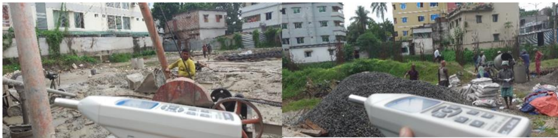
Figure1. Photographs of noise measurement construction sites.

buildings, real estate developments, and urban infrastructure including road extensions, have been underway in recent years. In the last three years, 3100 building construction plans and 5547 land use orders have been approved, and development projects are under construction (Rajshahi Development Authority, 2023). Besides, a few hyped projects in the infrastructure, education, health, agriculture, and communication sectors have been taken to shape a smart Rajshahi city (Abdullah, 2023).