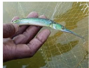
(g) Xenentodon cancila