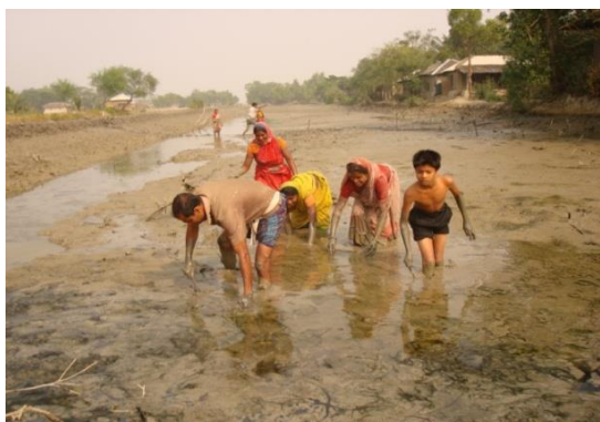
Figure 13: Use of insecticide result dead fish