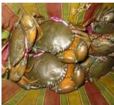
(g) Crabs: Parathelphusa convexa