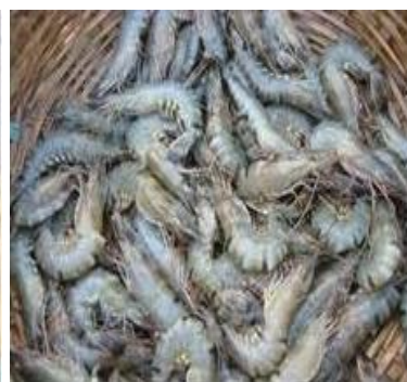
(i) Penaeus monodon