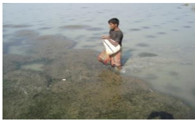
(a) Farmer using chemical in farm.

children play ground. In the past migration birds were found in the farm area but recently the number has decreased. Due to saline water intrusion, the numbers of trees are gradually decreasing. Both the farmers described that in the past they have different varieties species of shrimp (Harina, Chaka, Goda, Rosnaetc), fish (Vateki, Tere, Parsea, Khorkulo etc) and crab found in the farm as well as nearby farm canal or river. Nowadays, all those shrimp, fishes and crabs which come through the natural water flow in the farm has been tremendously decreases. They pointed out that now they stocked parsea ( Liza parsia ) fingerling in their pond but in the past natural grown fingerling was sufficient for the culture.