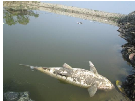
(b) Dead Liza vaigiensis after using insecticide