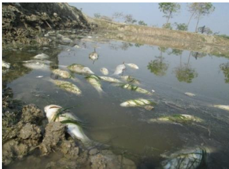
(a) Dead Liza parsia & Lates calcarifer