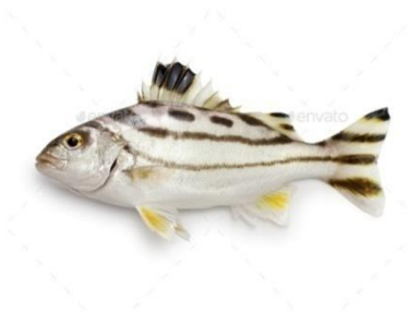
(f) Therapon jarbua