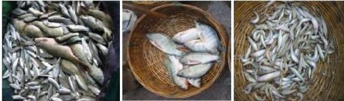
(a) Liza parsia & Lates calcarifer

farmer. Sales to the local market increases the independency from international market fluctuation and the protein supply of the local population. Polyculture also has the positive impact on protein supply in the community (5a - 5g).