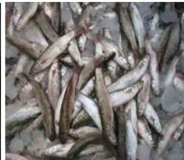
(f) Rhinomugil corsula