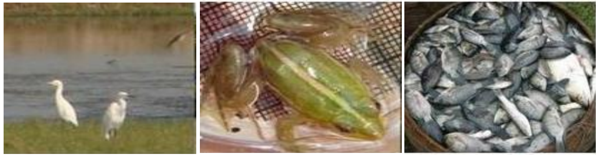
(a) Heron: Ciconia ciconia