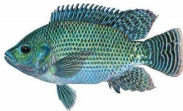
(e) Oreocromis mossambica