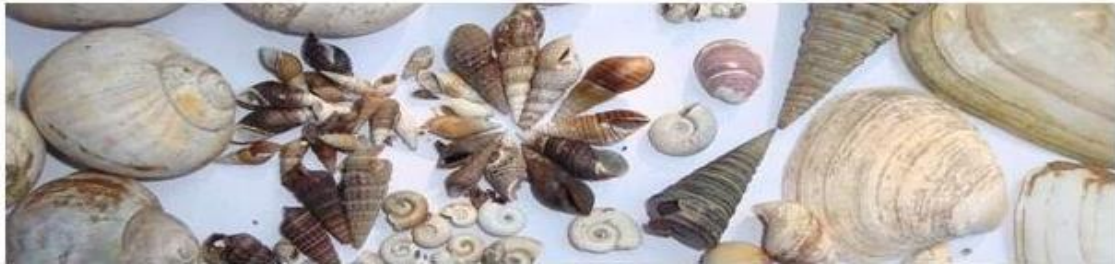
(d) Telescopium telescopium & Cerithidea cingulata and different species of mollusks