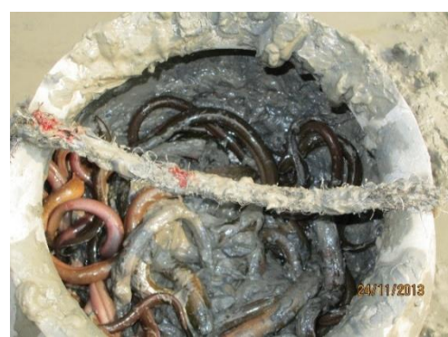
(f) Collected dead eel ( Monopetrus cuchia )