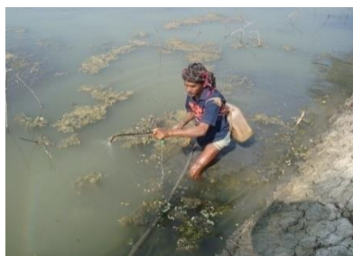
(d) Farmer spraying pesticide in Gher