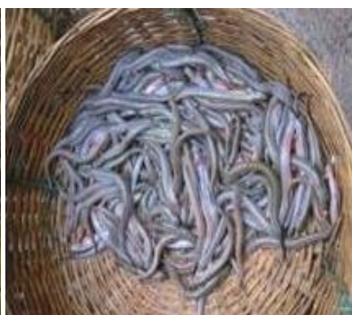
(h) Taenioides cirratus