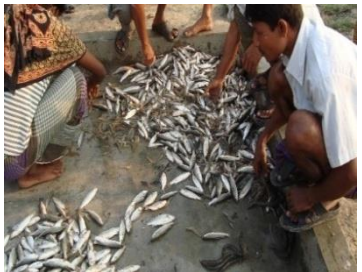
(d) Liza parsia & Liza vaigiensis