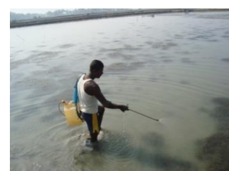
(c) Farmer spraying insecticide in prawn farming Gher