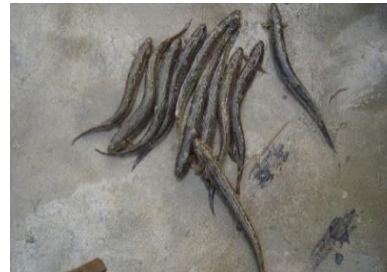
(f) Taenioides cirratus