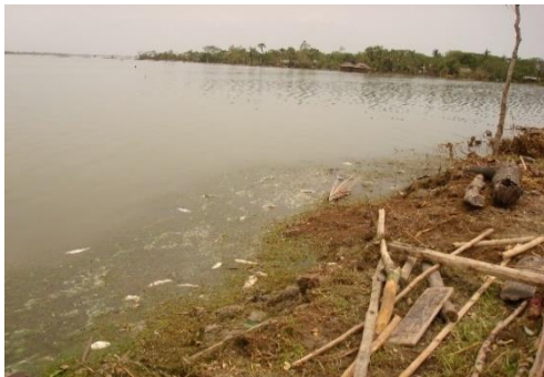
(c) Dead carp & Mulets sp.