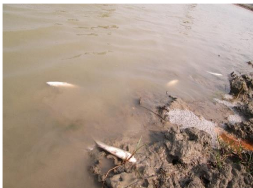
(e) Dead carp after using insecticide