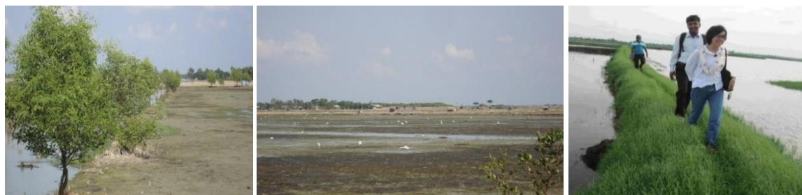
Figure 6: Biodiversity protected in organic farming area.

Farmer has to make the dike green at least 50% of the total farm dike otherwise farmer will be sanctioned from the organic certification. This is the standards of the certification body that organic farm dike has to make green with