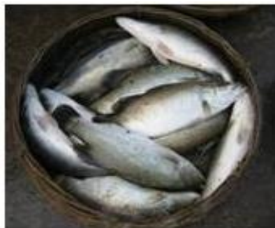
(e) Lates calcarifer