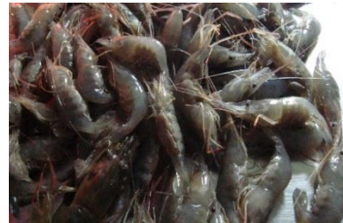
(c) Penaeus monodon Liza parsia & Mystus gulio