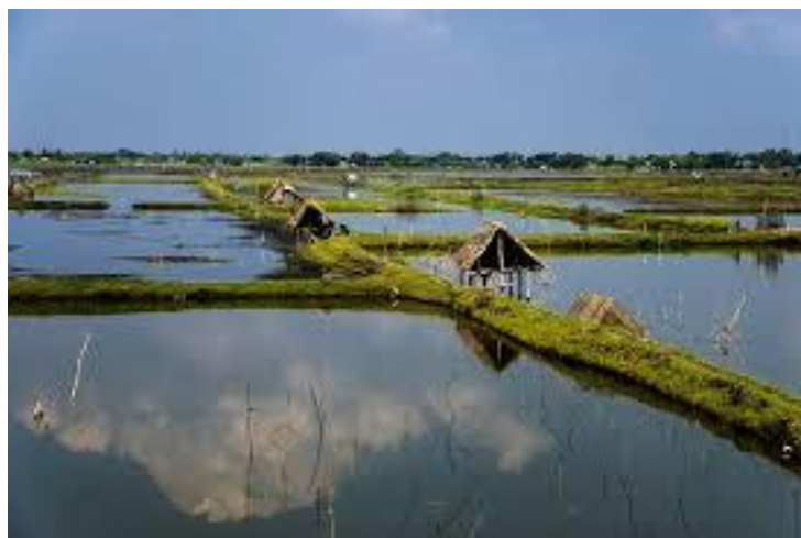
Figure 2: Shrimp Farming Gher in the study area