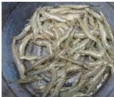
(d) Metapenaeus monoceros