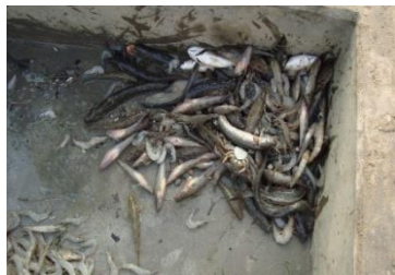
(a) Metapenaeus monoceros

development, zoning for coastal aquaculture, infrastructure development, enforcement of laws and regulations, and bolstering of extension services were all suggested by Alam (2002) as ways to improve present farming methods. Shrimp aquaculture-related individuals and institutions still need to be made more aware of the FAO Code of Conduct's existence, importance, breadth, and purpose.