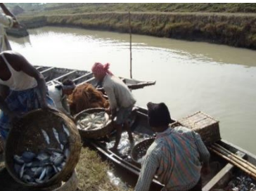
(e) Carp & Telapia