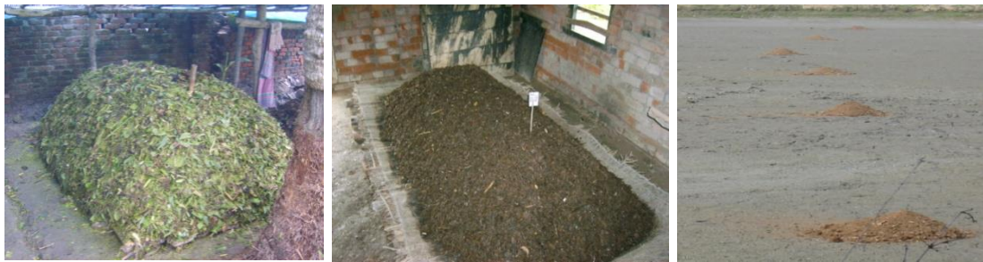
Figure 8: Compost used in organic farm for increasing natural productivity