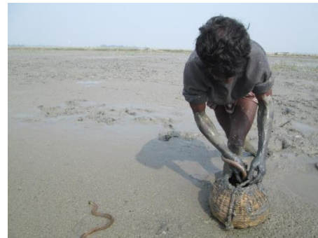
(d) Dead Eel collecting after using insecticide