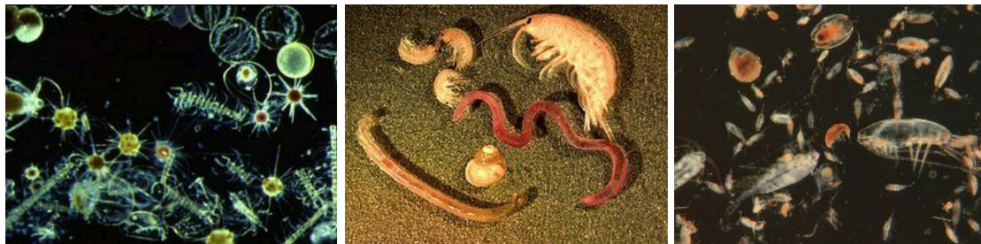
Figure 9: Rapid growth of benthos community grown by using organic compost

Wild catch from the river post larvae is not allowed for organic production. Only certified hatchery PL has to be stocked. Before hatcheries were developed in Bangladesh, shrimp farming had to rely on wild caught Post Larvae (PL) with negative impacts on the environment, because of the so called ‘by catch’ that is dominated by cnidarians, molluscs and other crustaceans than P. monodon and