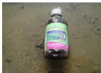
(b) Amconus (Insecticide bottle) which is destroying gher diversity