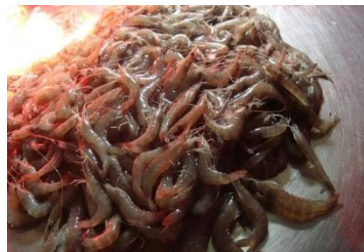
(b) Metapenaeus monoceros