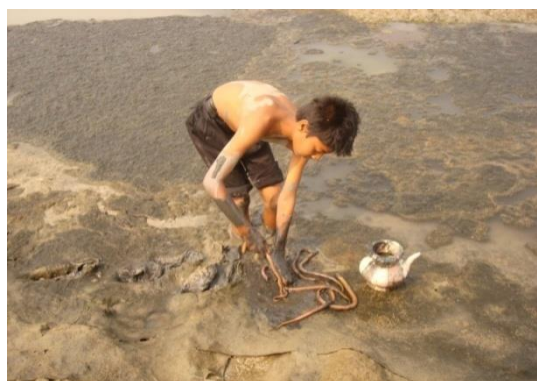
Figure 15: Women, men, and children catching fish, shrimp, and eel after using insecticide.

In the focus group meeting, farmers mentioned that several negative impacts on the ecosystem can change the natural biodiversity. Although they know chemical inputs have a negative impact, they are continuously using such inputs in the pond. They are also mentioned that other wild animals like frogs, snakes, and crustaceans are also now found in the pond insufficiently. In previous times different kinds of birds were seen than present. They also mentioned that, in their locality due to the saline water intrusion many types of trees are not growing properly. Among the participants three farmers thought were by using chemicals the wild animals are decreasing in pond, three other participants told that natural vegetation is not growing properly by traditional farming system, two participants reported that pond productivity is decreasing, and rest of the participants mentioned the change of natural ecosystem. Focus