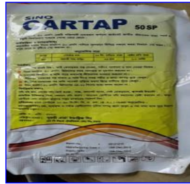
(f) Cartap (Pesticide packet) Cartap is a pesticide that was first introduced into the market in Japan in 1967.