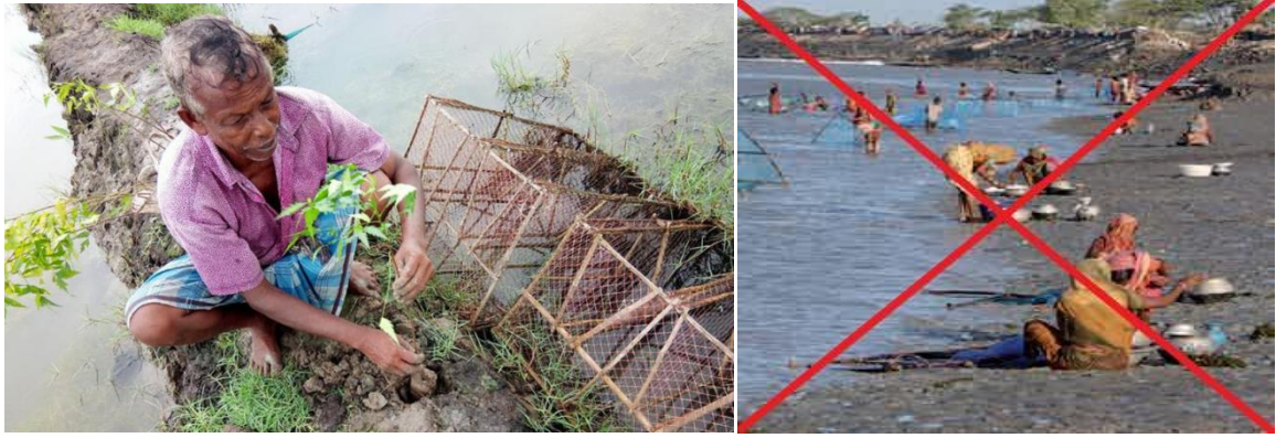
Certified organic: A new prawn paradigm in Bangladesh.