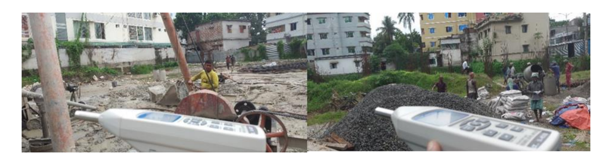
Figure 1. Photographs of noise measurement construction sites.

buildings, real estate developments, and urban infrastructure including extensions, have been underway in recent years. In the last three years, 3100 building construction plans and 5547 land use orders have been approved, and development projects under are construction (Rajshahi Development Authority, 2023). Besides, a few hyped projects in the infrastructure, education, health, agriculture, and communication sectors have been taken to shape a smart Rajshahi city (Abdullah, 2023).