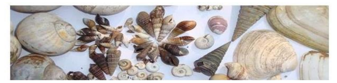
(d) Telescopium telescopium & Cerithidea cingulata and different species of mollusks