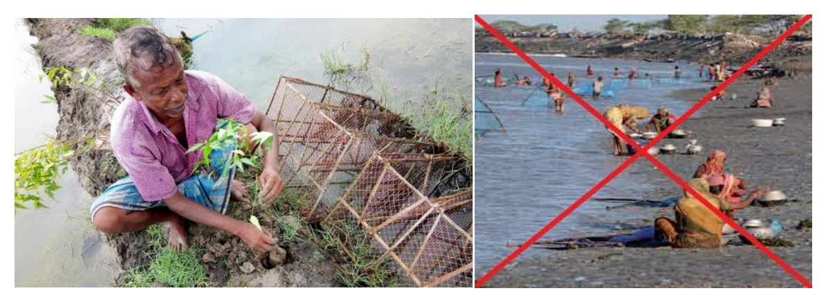
Certified organic: A new prawn paradigm in Bangladesh (Source: www.iucn.org).