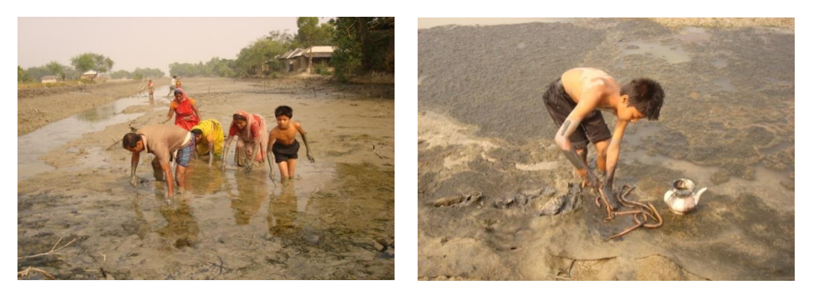
Figure 15: Women, men, and children catching fish, shrimp, and eel after using insecticide.

Figure 13: Use of insecticide result dead fish Figure 14: Live crab catching after using insecticide