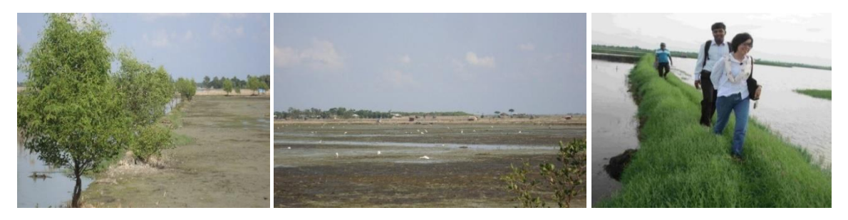
Figure 5(a- g): Biodiversity protected in organic farming