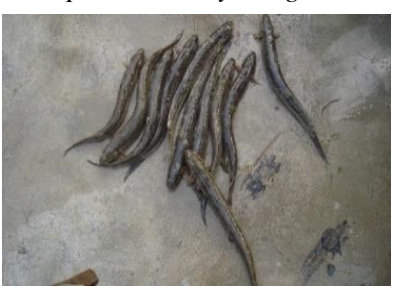
(f) Taenioides cirratus

(d) Liza parsia &. Liza (e) Carp & Telapia vaigiensis