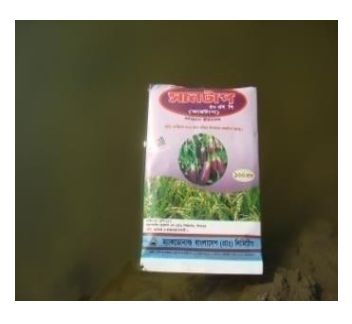
(e) Suntas (Insecticide packet)