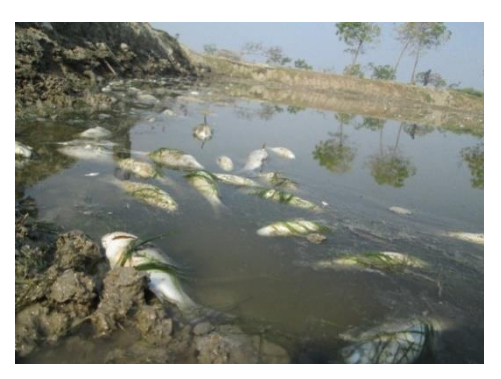
(a) Dead Liza parsia & Lates calcarifer