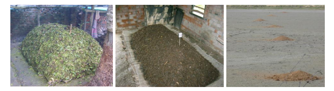
Figure 8: Compost used in organic farm for increasing natural productivity