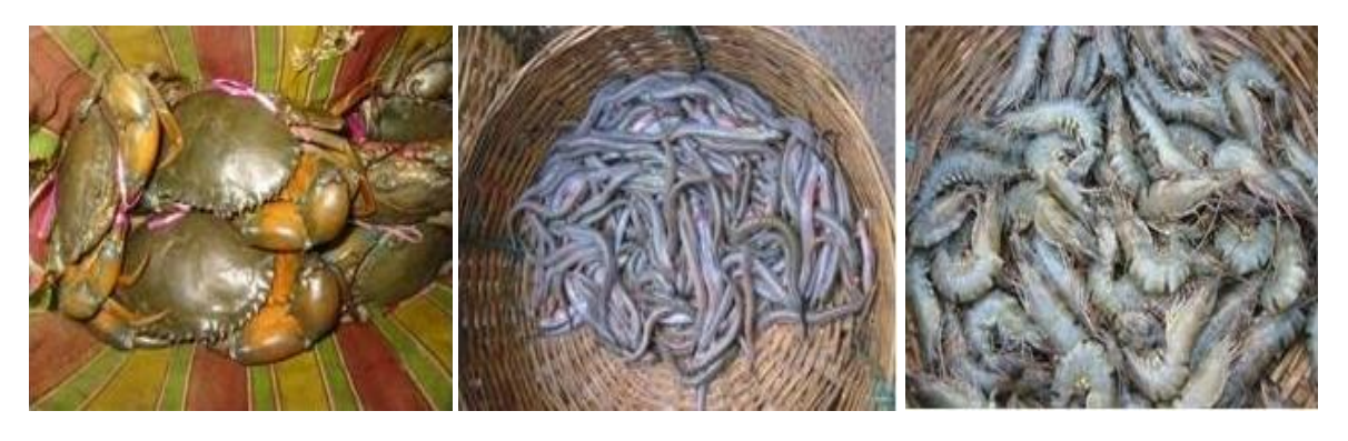
(g) Crabs: Parathelphusa convexa