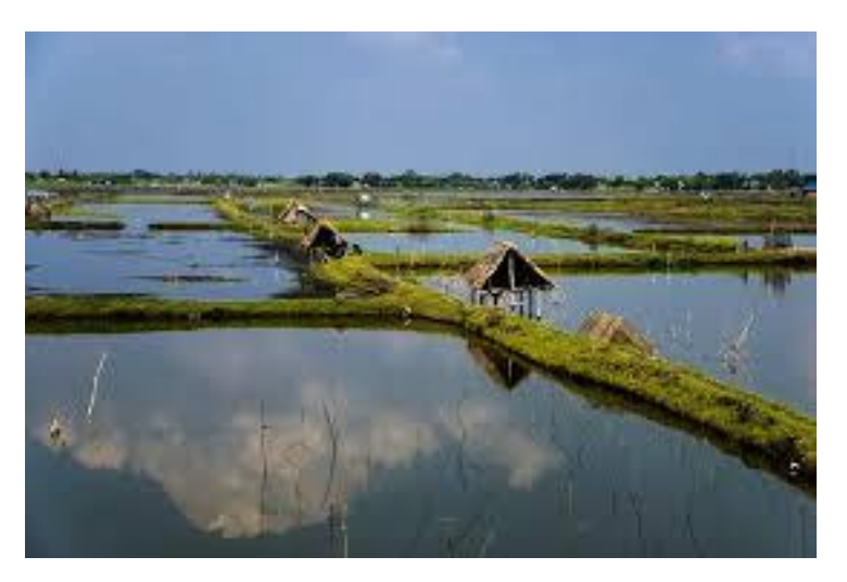
Figure 2: Shrimp Farming Gher in the study area