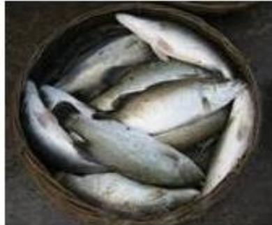
(e) Lates calcarifer