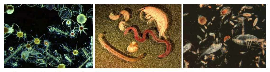
Figure 9: Rapid growth of benthos community grown by using organic compost

Wild catch from the river post larvae is not allowed for organic production. Only certified hatchery PL has to be stocked. Before hatcheries were developed in Bangladesh, shrimp farming had to rely on wild caught Post Larvae (PL) with negative impacts on the environment, because of the so called 'by catch' that is dominated by cnidarians, molluscs and other crustaceans than P. monodon and