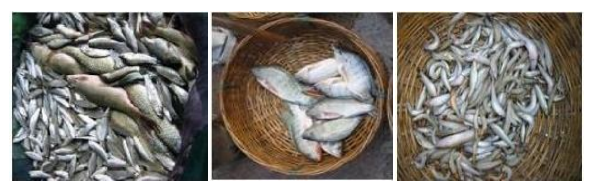
(a) Liza parsia & Lates calcarifer

farmer. Sales to the local market increases the independency from international market fluctuation and the protein supply of the local population. Polyculture also has the positive impact on protein supply in the community (5a -5g).