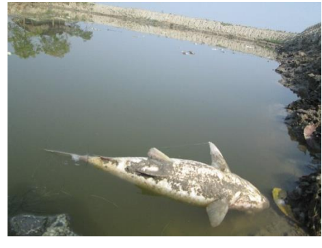
( b ) Dead Liza vaigiensis after using insecticide