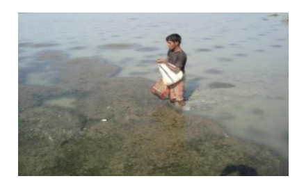
(a) Farmer using chemical in farm.

children play ground. In the past migration birds were found in the farm area but recently the number has decreased. Due to saline water intrusion, the numbers of trees are gradually decreasing. Both the farmers described that in the past they have different varieties species of shrimp (Harina, Chaka, Goda, Rosnaetc), fish (Vateki, Tere, Parsea, Khorkulo etc) and crab found in the farm as well as nearby farm canal or river. Nowadays, all those shrimp, fishes and crabs which come through the natural water flow in the farm has been tremendously decreases. They pointed out that now they stocked parsea (Liza parsia) fingerling in their pond but in the past natural grown fingerling was sufficient for the culture.